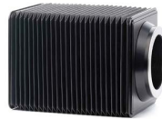
Bellows, 24 cm, DSLR (f= 150-240)