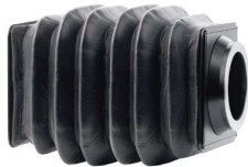
Bellows, 20 cm, DSLR (f= 120-180)