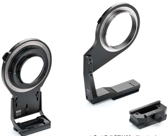
e.g. rotaFoot Sony E